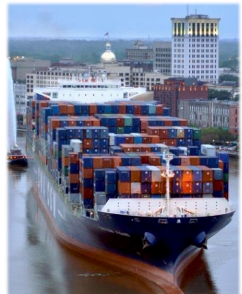
Savannah Harbor