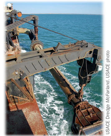
USACE Dredge McFarland