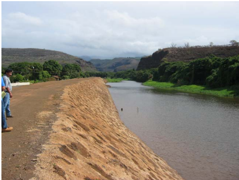
q. RSN 41+52, Overview of CRM, remove structure in river, @ Culvert # 3.