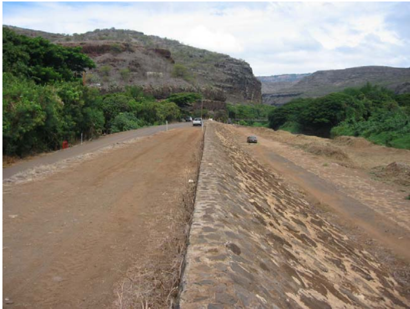
u. RSN 66+00, Overview of levee.