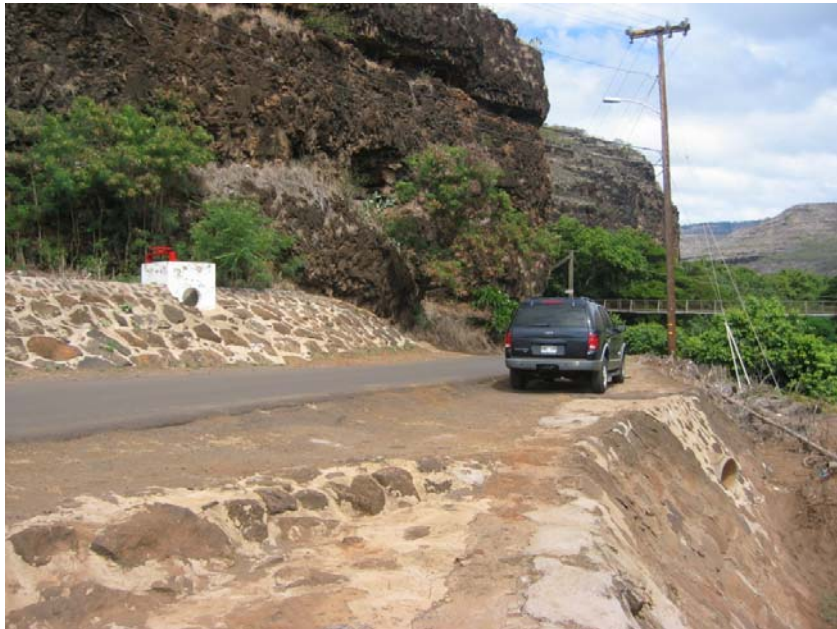
z. RSN 73+91, Sluce Gate # 11, end of project.