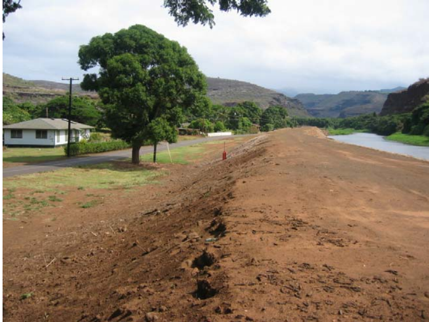
p. RSN 40+00, Townside of levee regraded.