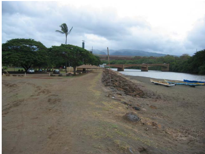
a. RSN 1+00, overview at start of project Oceanside.