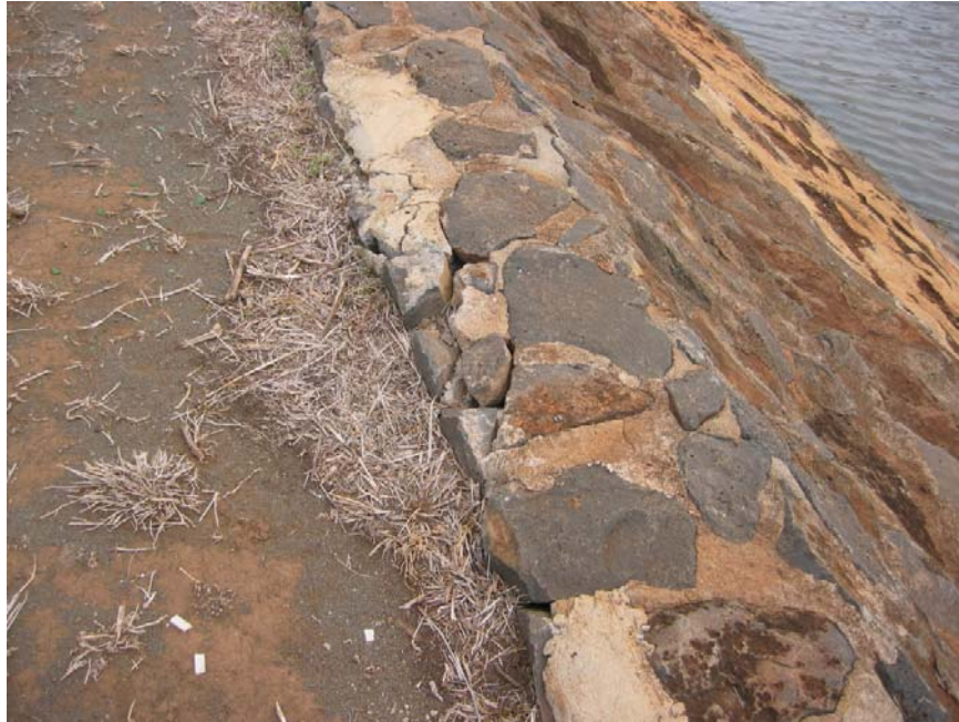
h. RSN 13+50, repair CRM edge at 2 areas.