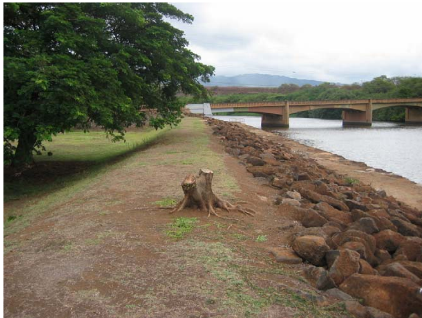
c. RSN 4+20, remove tree stump.