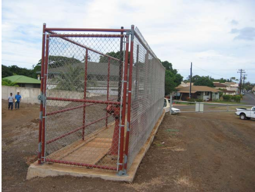
f. RSN 10+42, 5 floodgates, all gates cycled 7/17/07 and fence installed.