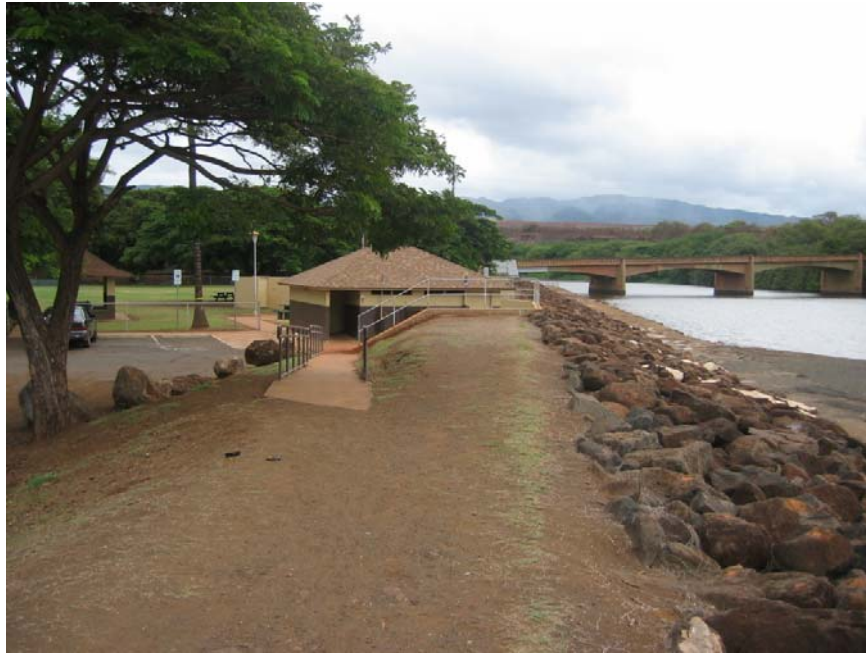
b. RSN 2+50, Authorized ADA Ramp.