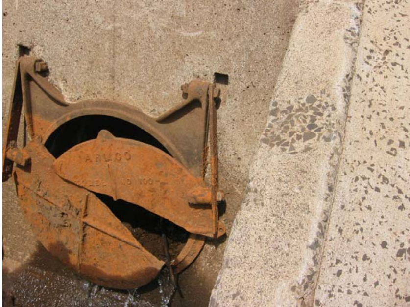
r. RSN 49+72, Replace broken 24" flapgate.