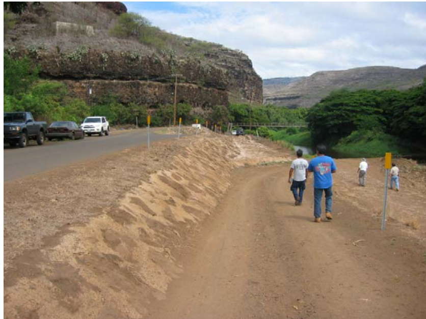
w. RSN 69+50, Overview of CRM and access road.