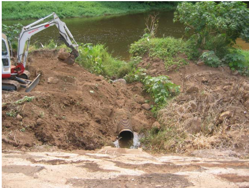
s. RSN 58+54, Contractor's temporary access.