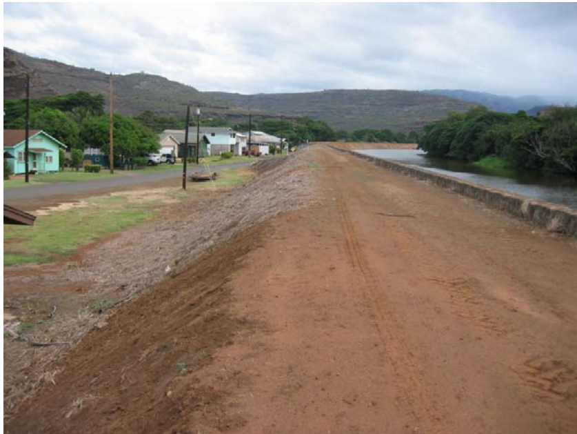
k. RSN 26+00, Overview of concrete rubble masonry (CRM) no vegetation. (Even w/Clubhouse)