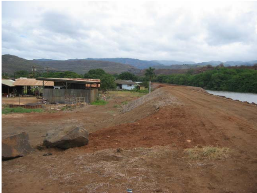
g. RSN 12+00, Levee sideslope in good condition.