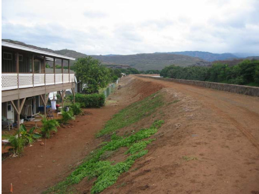
j. RSN 18+00, Townside of levee regraded.