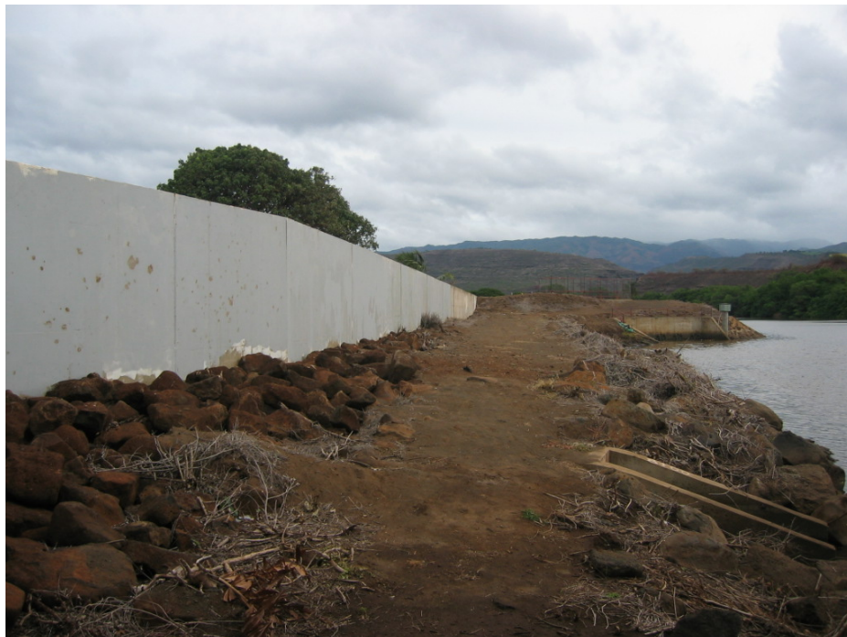
e. RSN 9+00, Start of floodwall.