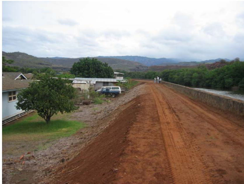
i. RSN 14+00, Overview.