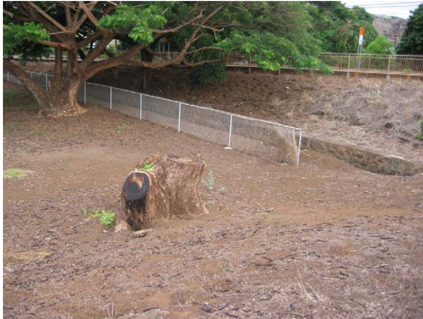
d. RSN 6+50, remove tree stump.