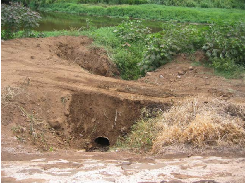
t. RSN 61+70, Temporary access at culvert / flapgate # 7, in good working order.