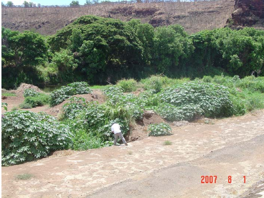
v. RSN 63+75, Culvert / Flapgate # 8 in good working order.