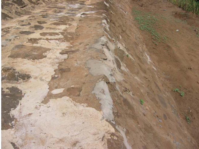
x. RSN 72+90, CRM sideslope repaired.