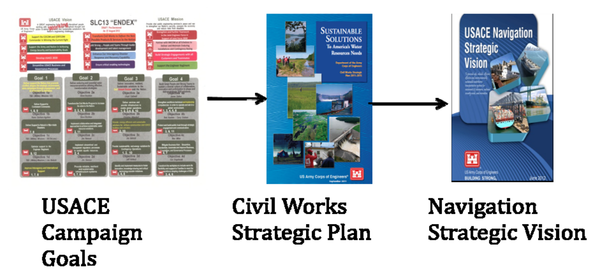
Figure 1. Relationship between the USACE Campaign Goals, Civil Works Strategic Plan, and Navigation Strategic Vision.

To maintain America's role as a premier trading partner in the global marketplace and to strive to achieve the Administration's goal of doubling U.S. exports over the next five years, the MTS must continue to provide safe, reliable, efficient, and environmentally sustainable movement of cargo. The USACE Navigation Strategic Vision seeks to guide decisions in order to improve mission delivery as measured against the following primary performance indicators (metrics):